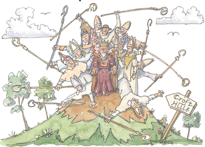
Supported by Welcome Back Funding